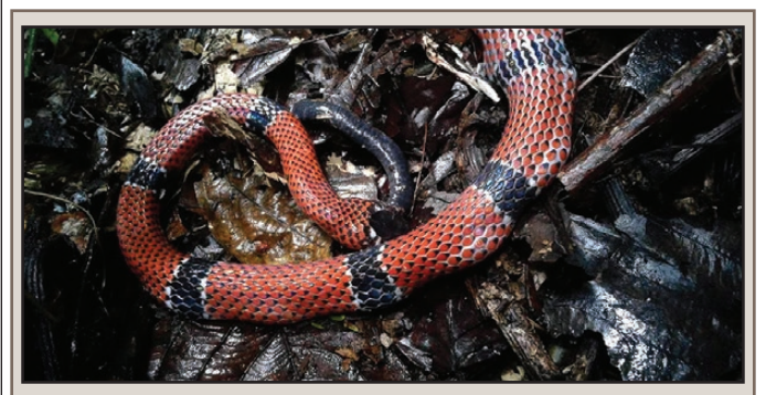
Fig. 1. Micrurus dumerilii ingesting a Caecilia thompsoni in the Reserva Río Manso, Colombia.

We thank the Vertebrate Zoology course (2017-1 period) of the Biology program of the Universidad de Caldas for support in the field.